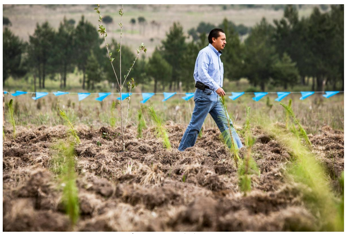
Reforestation, Estado de Mexico